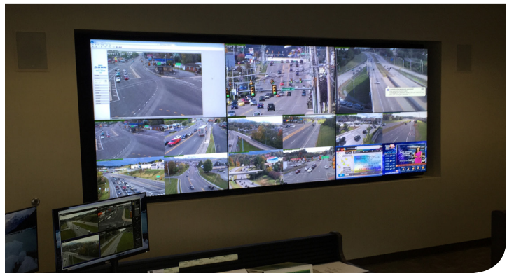
Traffic Operations Center