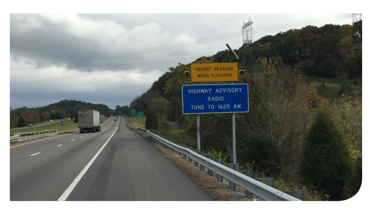
Highway Advisory Radio

Johnson City MTPO Data Warehouse Implementation