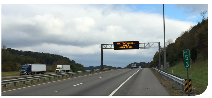
Dynamic Message Signs