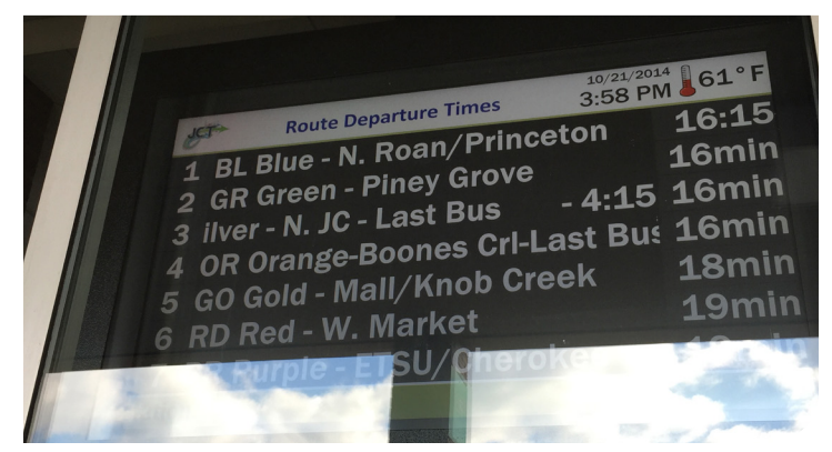
Real-Time Transit Information